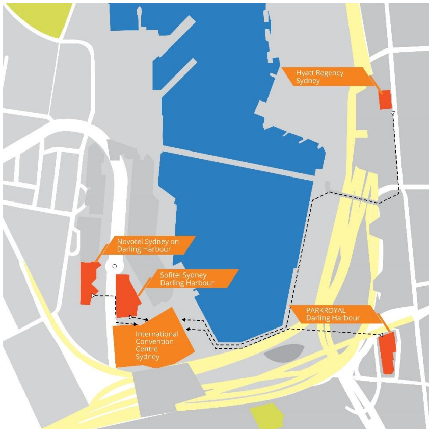
Map indicating the walking route from Novotel Sydney on Darling Harbour to ICC Sydney, for reference.